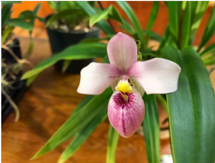
Phrag. schlimii Terry Whettam