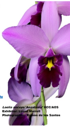
Laelia anceps 'Anastasia' HCC/AOS Exhibitor: Lynn Murrell

There is no cost to attend judging. Standard entrance fees apply to visit filoli.org .