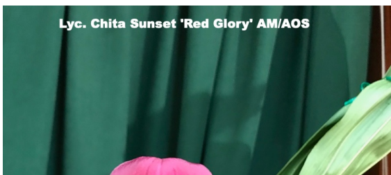
Lyc. Chita Sunset 'Red Glory' AM/AOS