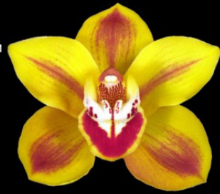
Cym. Tower of Fire 'Sunset Flame'.

San Mateo Garden Center 605 Parkside Way San Mateo, CA 94403