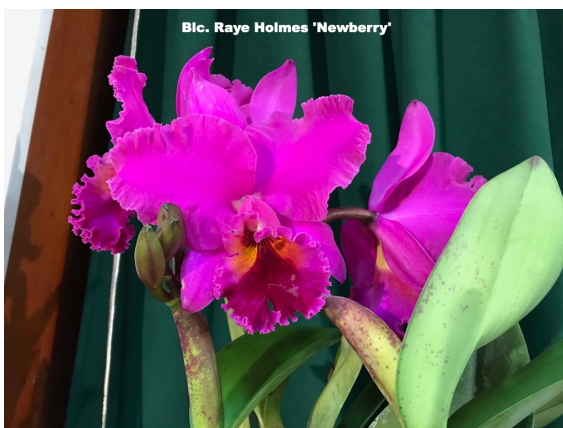
Blc. Rave Holmes 'Newberry'