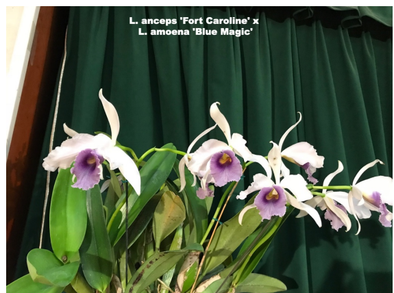
L. anceps 'Fort Caroline' x L. amoena 'Blue Magic'