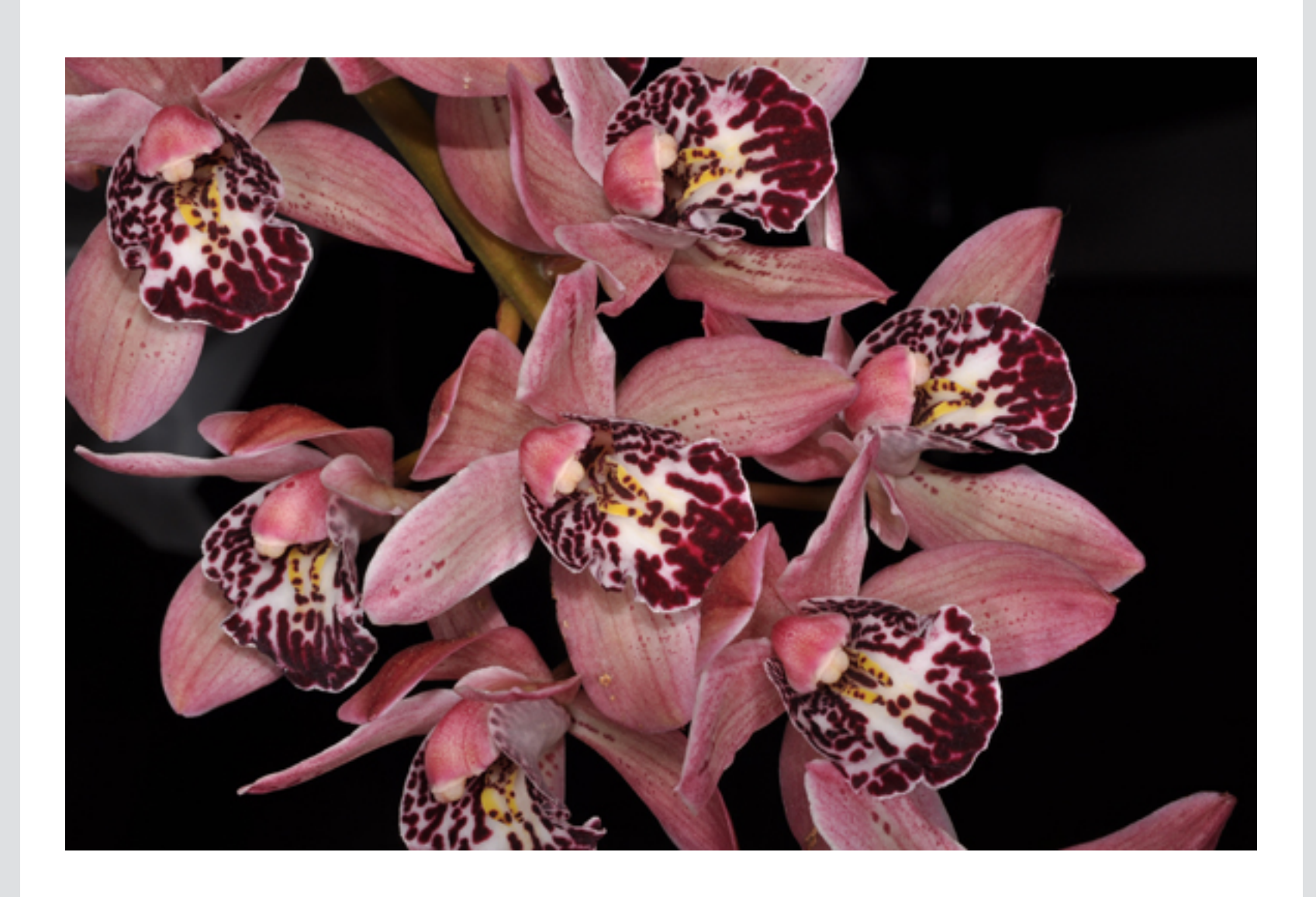
Santa Cruz Orchid Society Newsletter March 2018