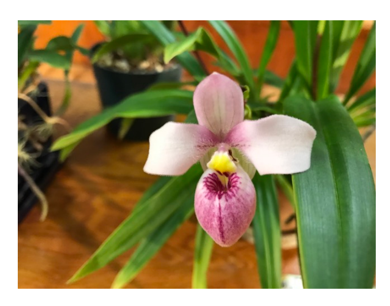
Phrag. schlimii Terry Whettam