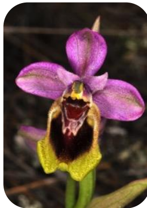
Sawfly Orchid Ophrys tenthredinifera