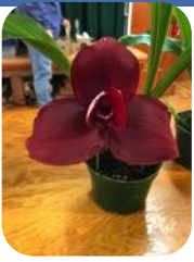
Lyc. Abou Rits 4N x Lyc. Abou Rits 2N