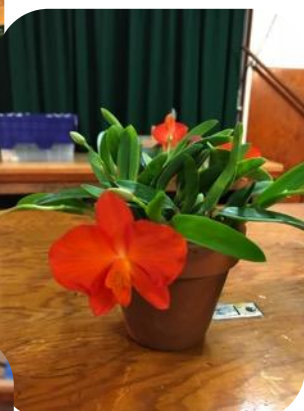
Sophranitis coccinea 4N