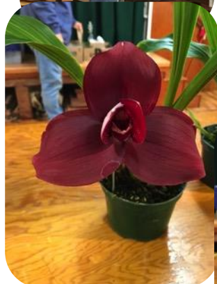
Lyc. Abou Rits 4N x Lyc. Abou Rits 2N