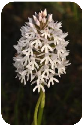
Pyramid Orchid Anacamptis pyramidalis

Below are examples of orchids from Spain.