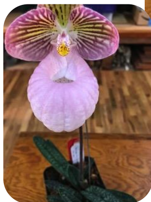
Paph. micranthum 'Rainbow Bay Joni'