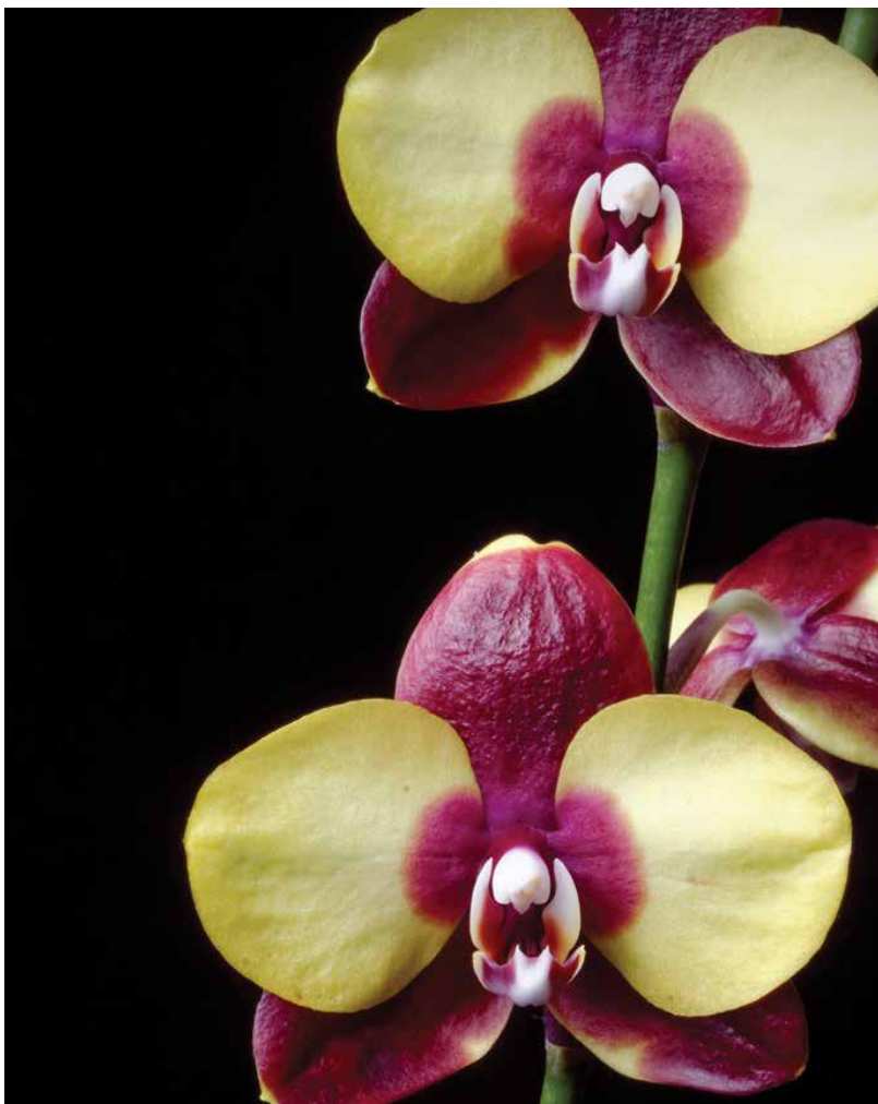
Phalaenopsis Peoker Beauty 'Bredren', JC/AOS (Salu Peoker x Diamond Beauty) was exhibited by Bredren Orchids in January at the 2014 Tamiami International Orchid Show in Miami, FL.

GET MOVING Dry conditions tend to prevail when the heaters are on in the greenhouse or radiators are blasting under your windowsills. Keep in mind that the majority of the tropical orchids we grow thrive in humid, circulating air like they'd experience in their montane, treetop perches. Dry heat will cause many