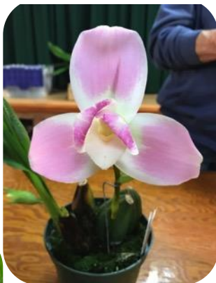
Lyc. Nagai International 'Monterey Bay' AM/AOS Scott Collins