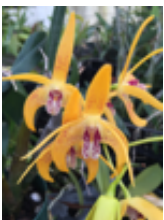
D. Avrils Gold